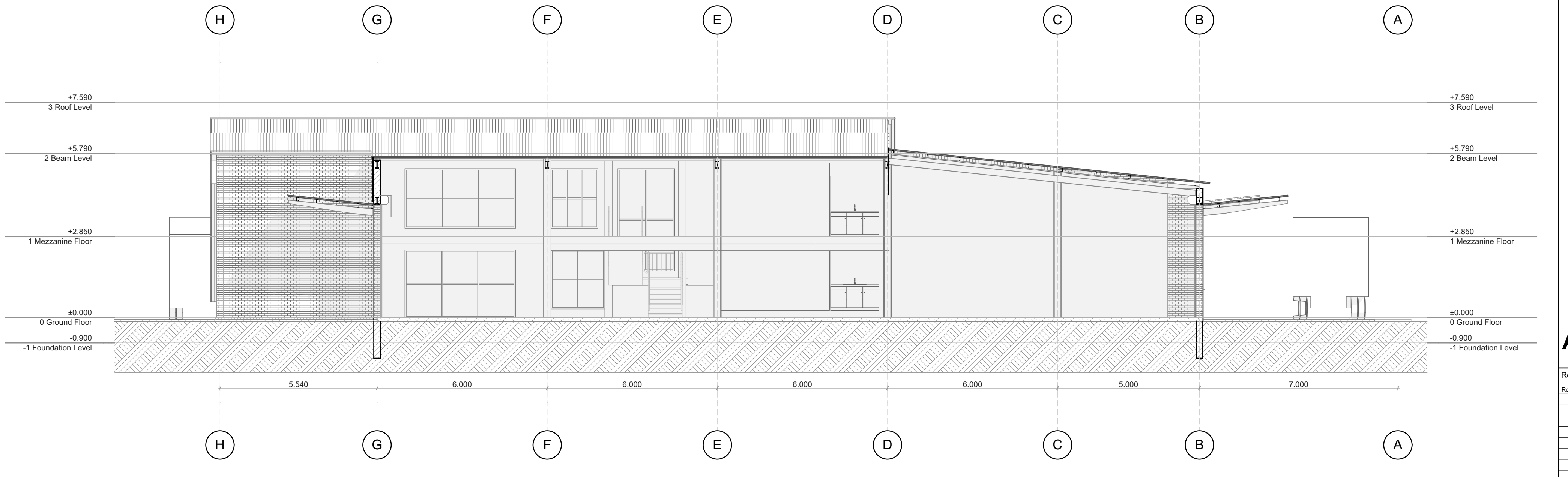
A-A5 Building Section 1:100