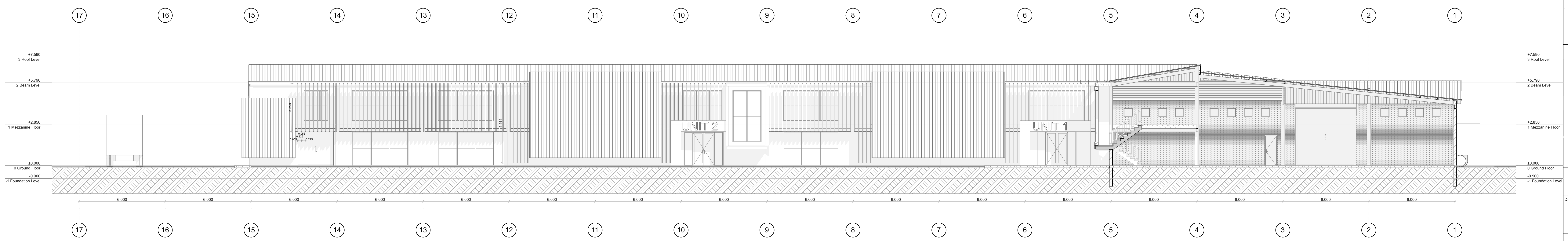
A-A4 Building Section 1:100